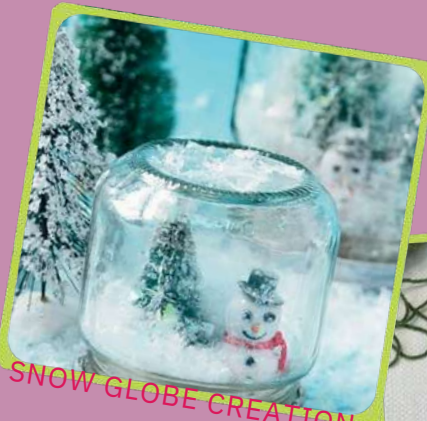
SNOW GLOBE CREATION