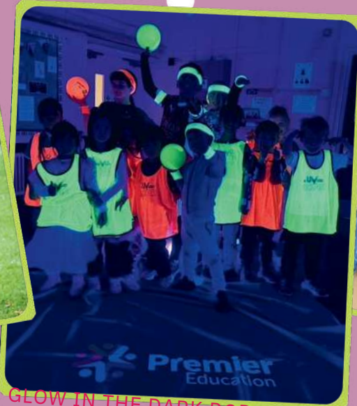
GLow IN THE DARK DODGEBALL