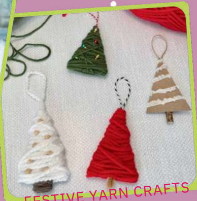
FESTIVE YARN CRAFTS